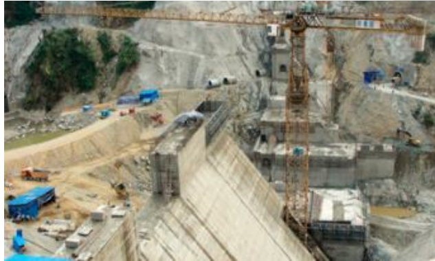
The Myitsone Dam under construction

BREAKING NEWS: In a huge success for civil society groups in Burma, China and internationally, the Burmese government on September 30, 2011, decided to suspend the Myitsone Dam until 2015. Read our latest press release . More news to follow soon.